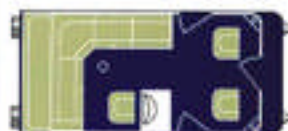
M-818 Fish SD