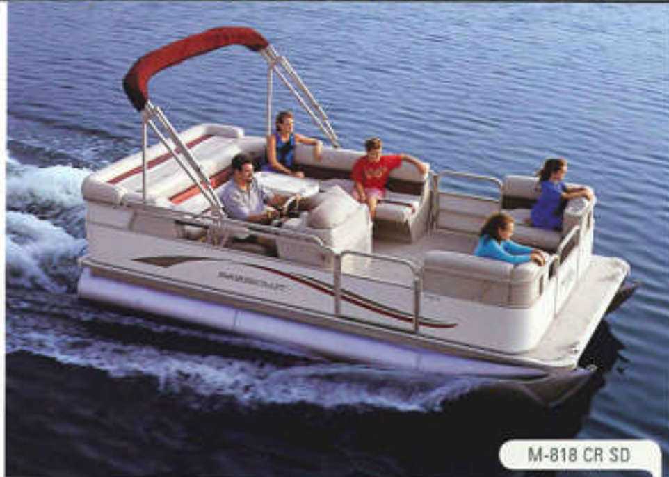
M-818 CR SD