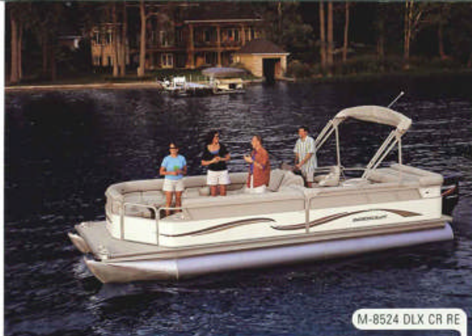
M-8524 DLX CR RE