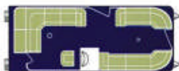
M-8522 CR RE