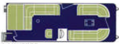
S-8525 CR RE