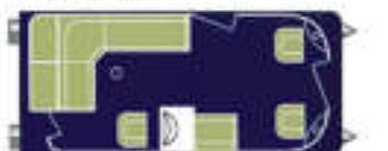
M-8520 Fish RE