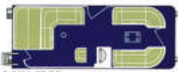
S-8523 CR RE