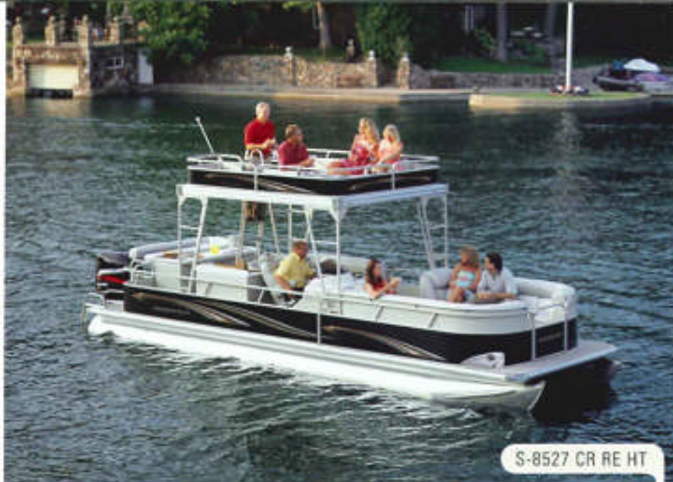
S-8527 CR RE HT