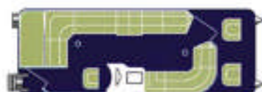
M-8524 DLX Fish RE