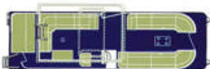
S-8527 CR RE HT