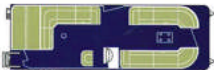
S-8527 CR RE