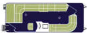
M-8522 DLX CR RE