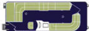
M-8524 DLX CR RE