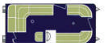
M-8520 CR RE