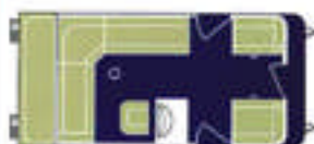
M-818 CR SD