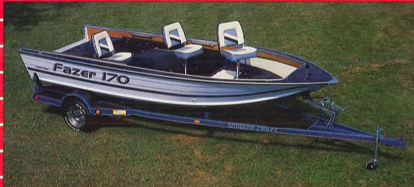
Ask about the new Smoker-Craft custom trailers built especially for a variety of Smoker-Craft boats.