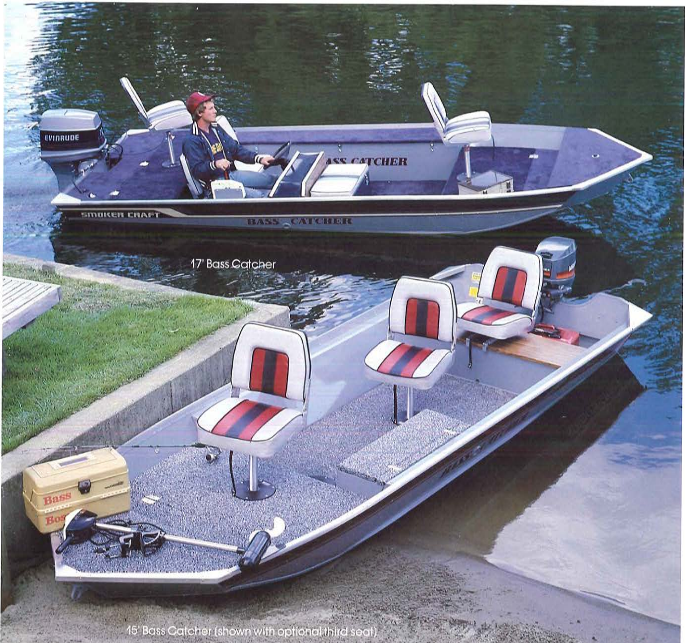
17' Bass Catcher