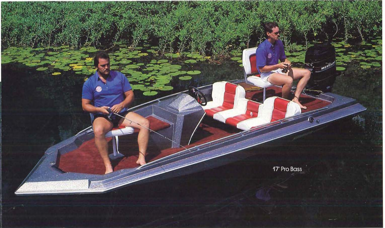
17' Pro Bass