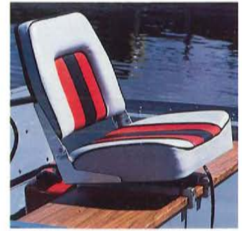
Swivel seats with arms for fishing boats