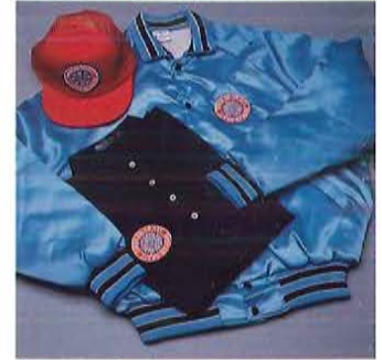
Smoker-Craft jackets, shirts and hats