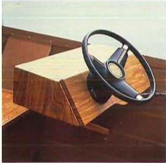
Side steering console for most Smoker-Craft fishing boats