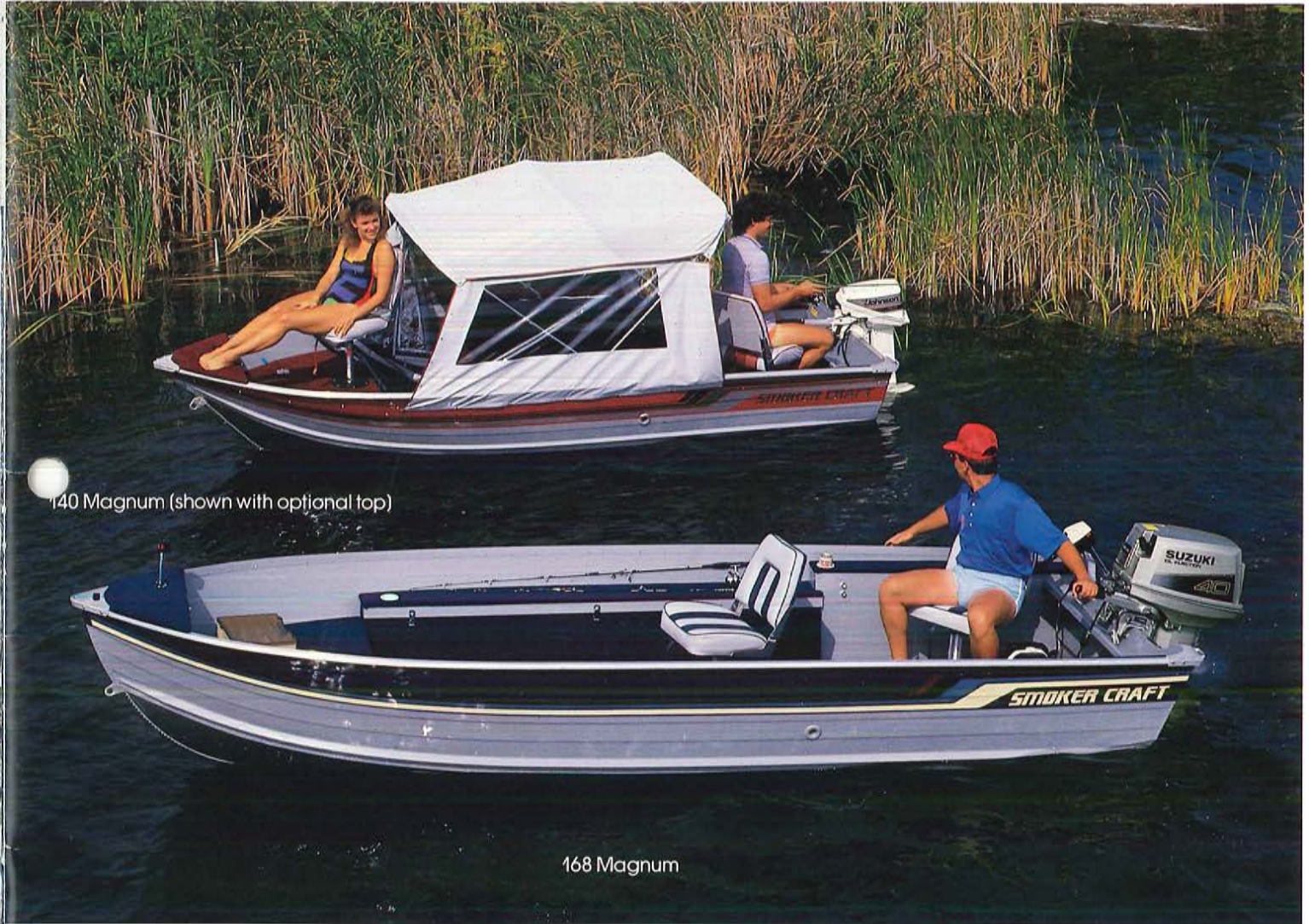
140 Magnum (shown with optional top)