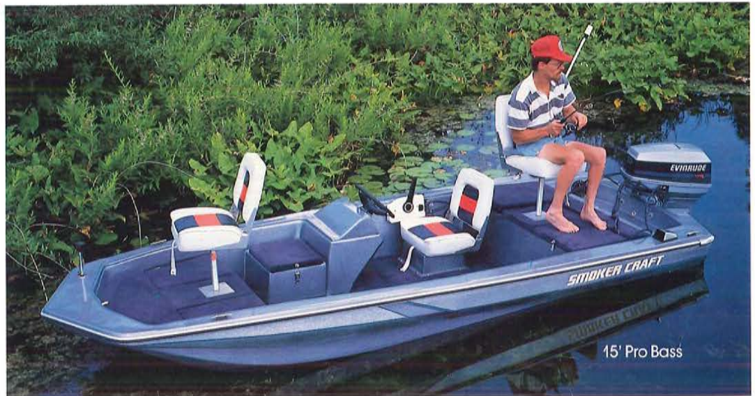
15' Pro Bass

Our fiberglass Pro Bass are loaded with all the right equipment for winning bass fishing. They will get you to the hot spots fast. Storage for all your fishing gear can be found easily on the Pro Bass.