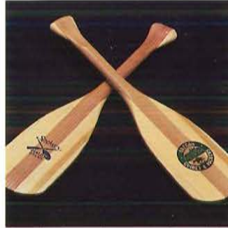
Quality brand oars and paddles