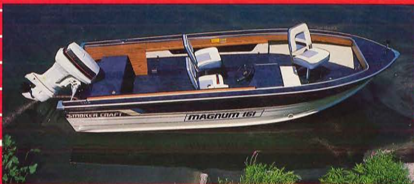
There's more to like about our Magnum series with new sizes and features. Pages 2-5.