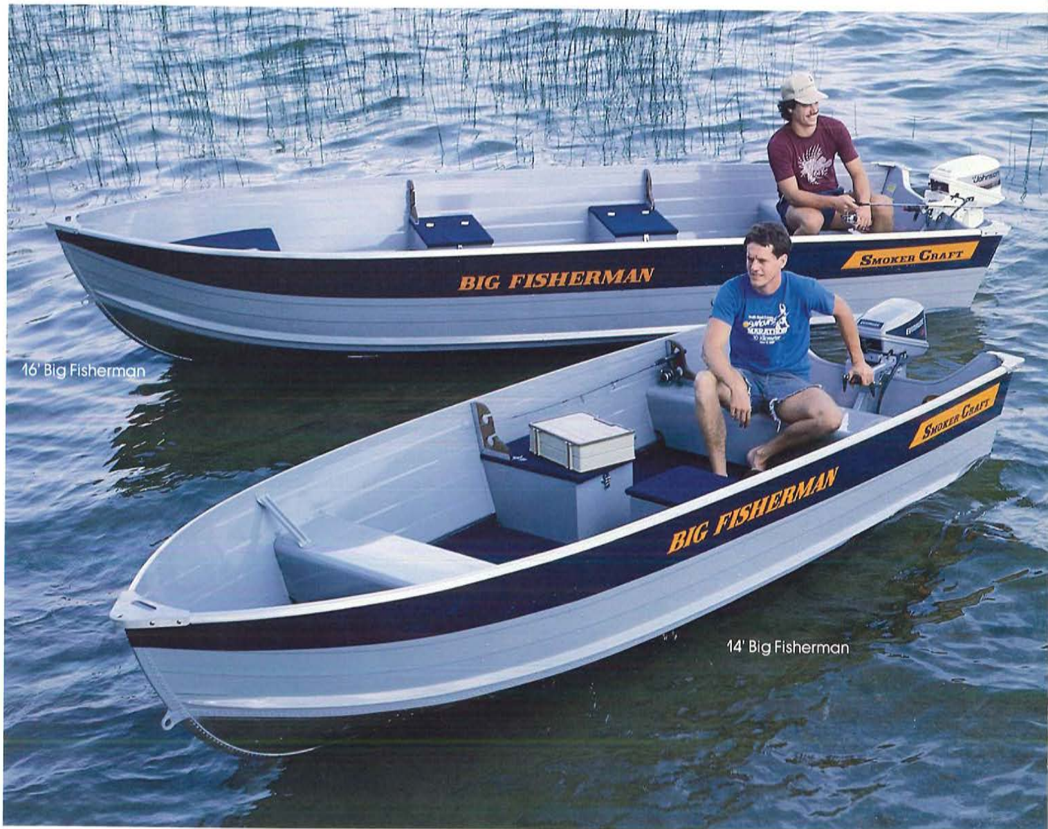
16' Big Fisherman