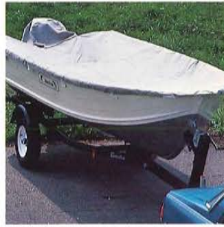
Mooring covers available