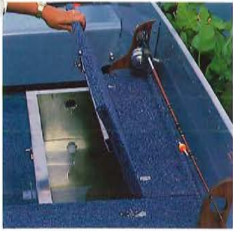
Optional live wells available