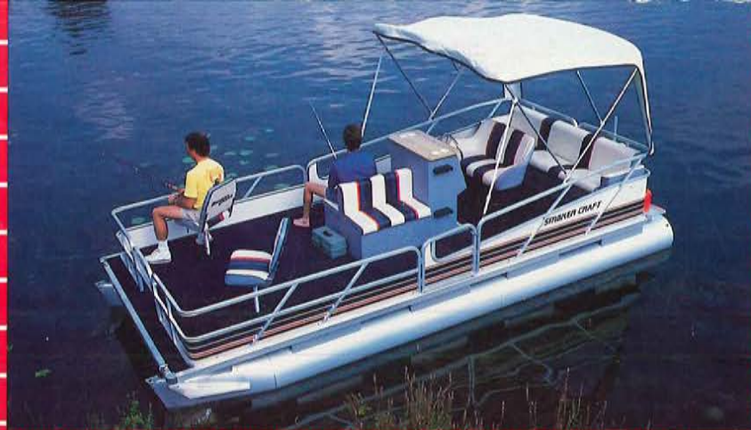
Our 1988 fishing pontoon is just one of Smoker-Craft's new fishing weapons. Pages 16-17.