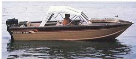
Convertible tops optional