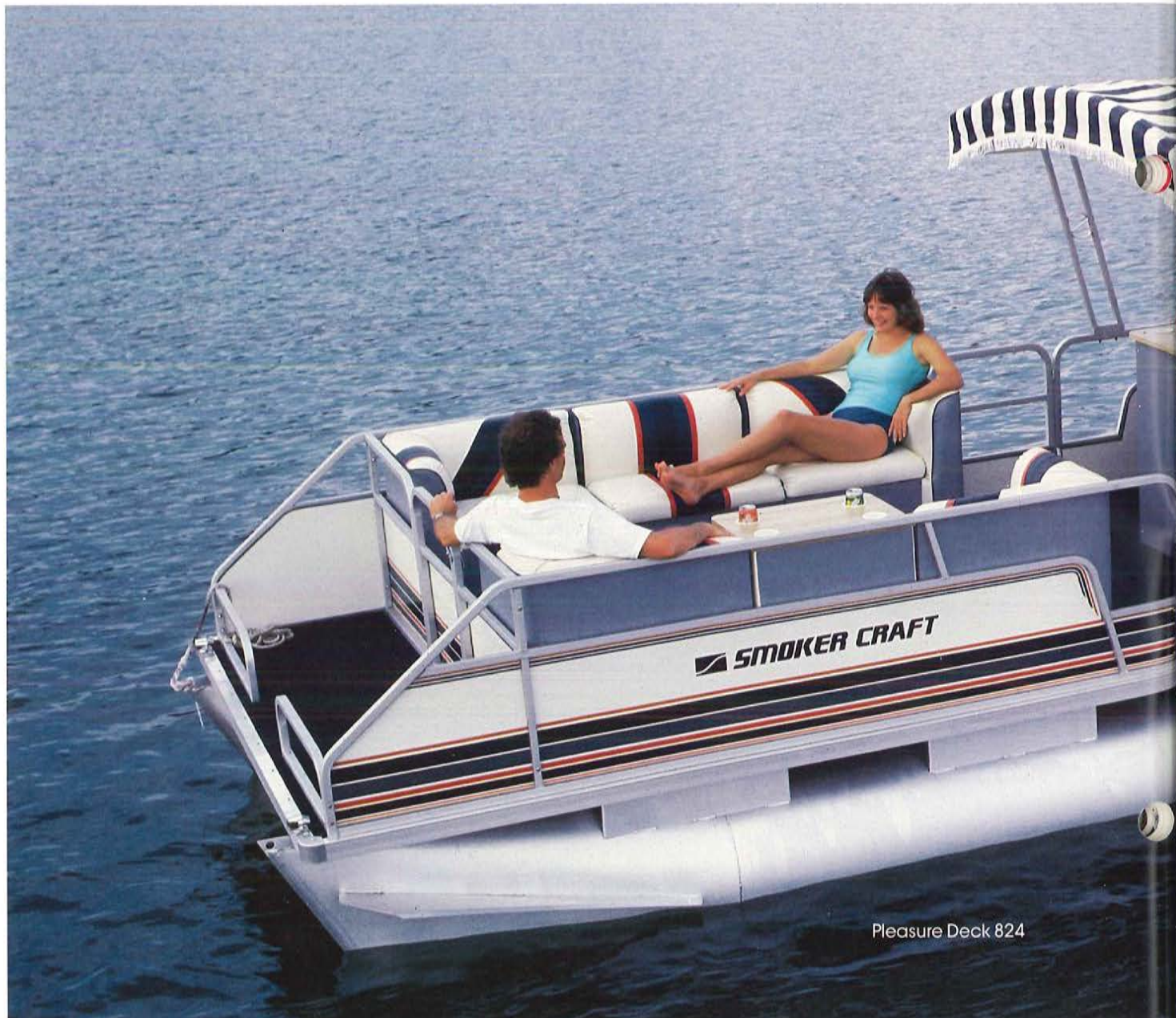
Pleasure Deck 824