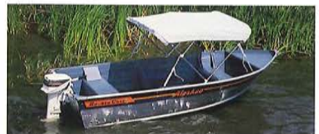
Sun tops optional