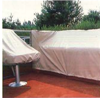
Pontoon furniture covers