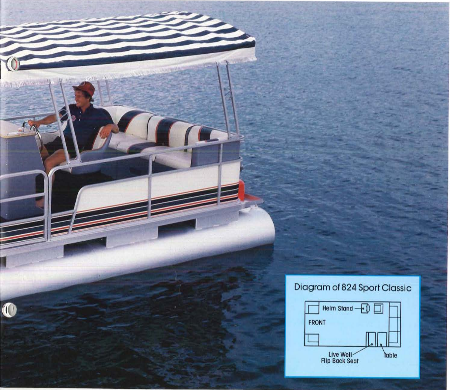
Diagram of 824 Sport Classic