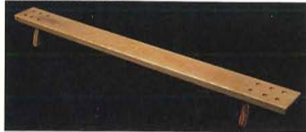
Downrigger boards available