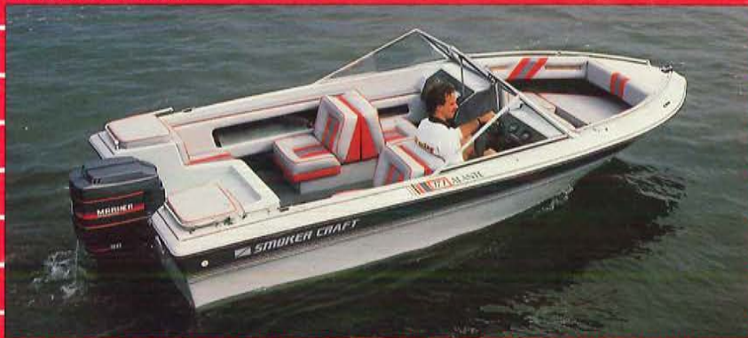
The new fiberglass Alante runabouts are available in both I/O and OB models. Page 18.