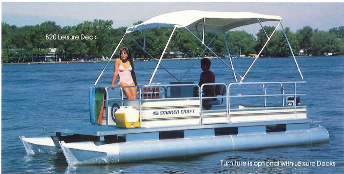
Furniture is optional with Leisure Decks