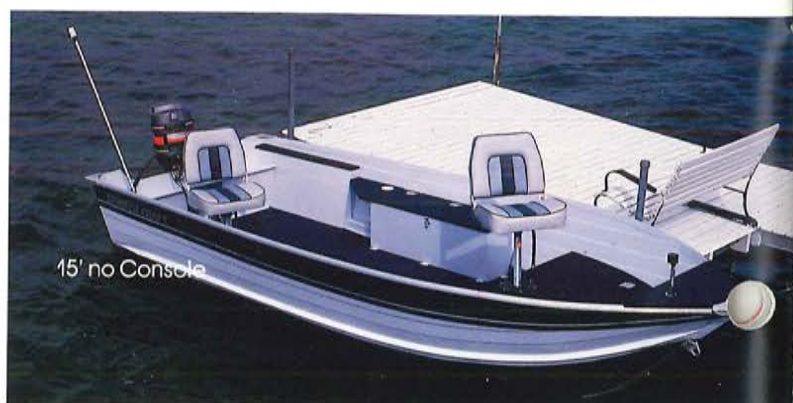
15' no Console