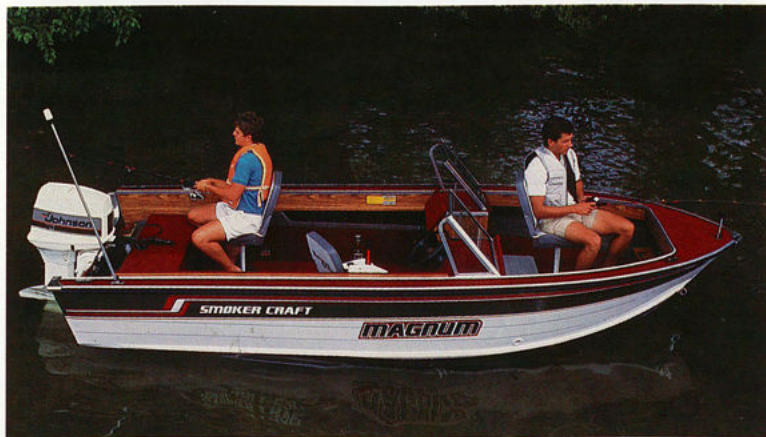
162 Magnum Length: 16'2" Beam: 76" Horsepower: 80 Weight: 740 Capacity: 1400