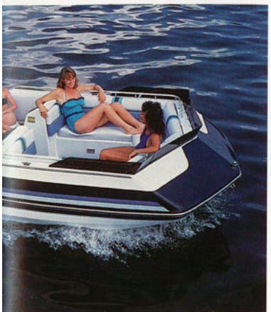
260 Weight: 1140 Capacity: 1800