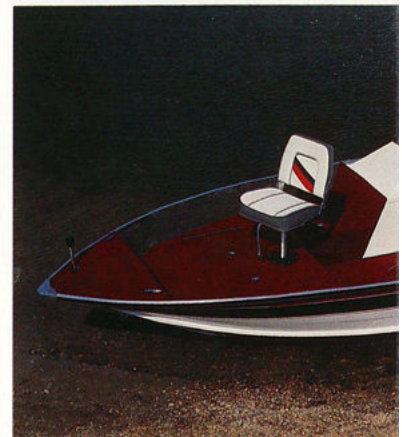
171 Lazer Length: 17'1" Beam: 80" Horsepower: