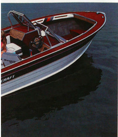
er: 90 Weight: 665 Capacity: 1510