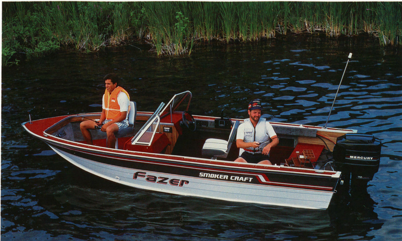
172 Fazer Length: 17'5" Beam: 80½" Horsepower: 115 Weight: 860 Capacity: 1350