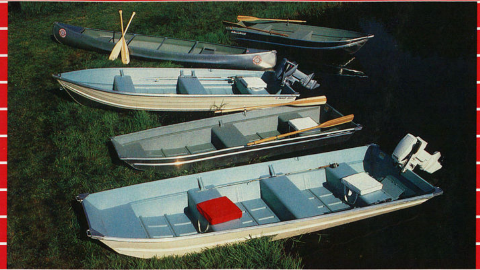
Smoker-Craft offers a great variety of top quality, economical fishing boats. Look inside for information on models and sizes.

10-Year Limited Warranty At Smoker-Craft, quality and reliability are built in to every boat we make. All of our aluminum boats are backed by a 10-year limited warranty. Our pontoons feature the XL50 50-year floor warranty. Over the past several years we have experienced tremendous growth. We know this would not have been possible without high quality products and satisfied customers. Keeping you satisfied will always be our highest priority.