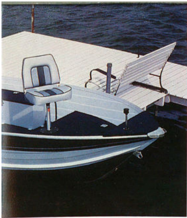
er: 50 Weight: 520 Capacity: 1000