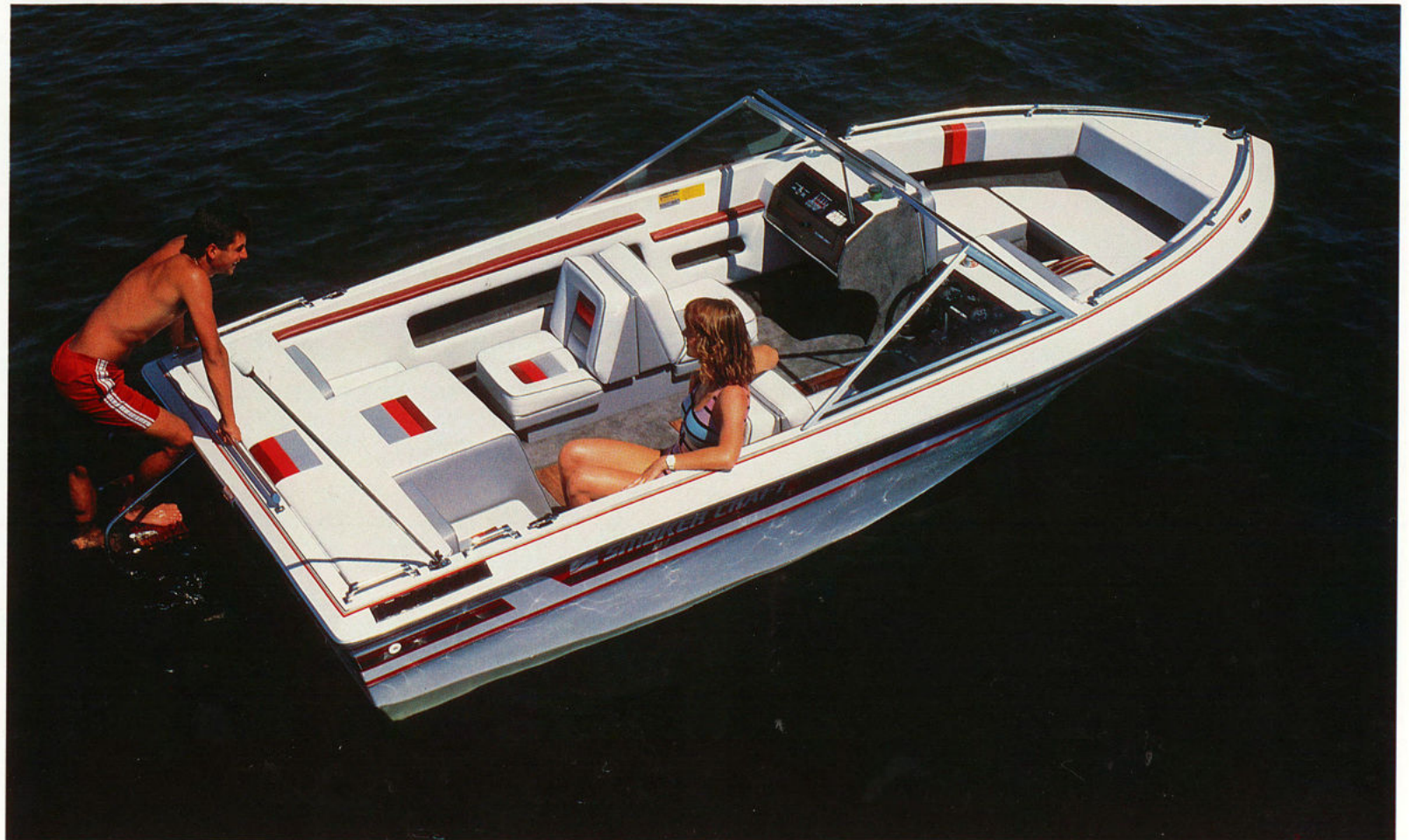
17' Alante I/O Length: 16'8" Beam: 90" Horsepower: 175 Weight: 1200 Capacity: 1565