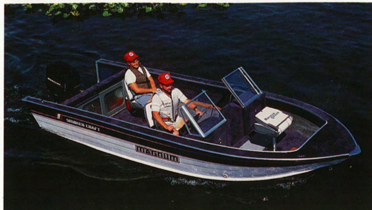
182 Magnum Length: 18'5" Beam: 84" Horsepower: 140 Weight: 1140 Capacity: 1810

Smoker-Craft's variety of quality aluminum and fiberglass boats is second to none. Fishermen rely on us to provide boats that fit many fishing needs. Pleasure boaters appreciate the choices from our complete line of pontoons, deck boats and stylish runabouts. Whatever your boating needs, we're confident that we have a boat that's right for you.