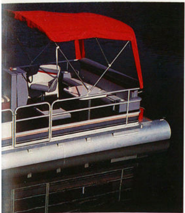
35 Weight: 1170 Capacity: 1200