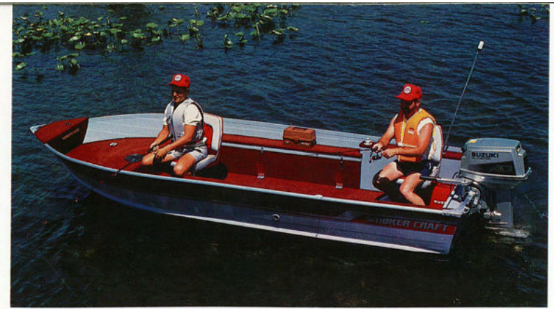
168 Magnum Length: 16'10" Beam: 69¼" Horsepower: 50 Weight: 540 Capacity: 1100