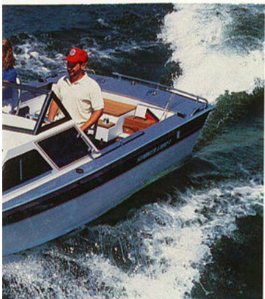
er: 120 Weight: 1235 Capacity: 1825