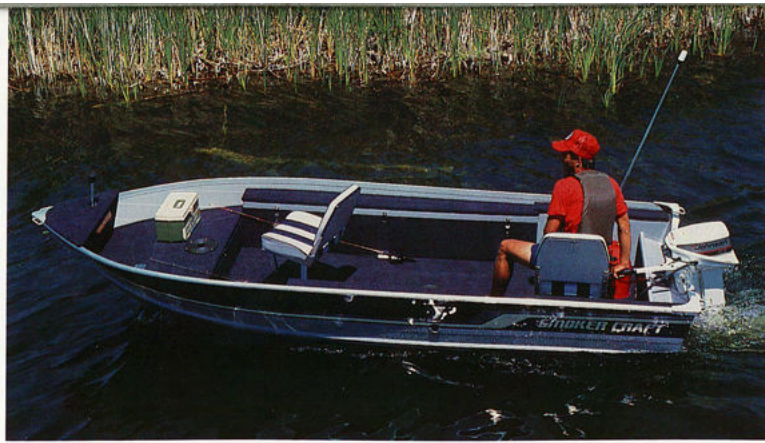
140 Magnum Length: 14'5" Beam: 67½" Horsepower: 40 Weight: 440 Capacity: 975