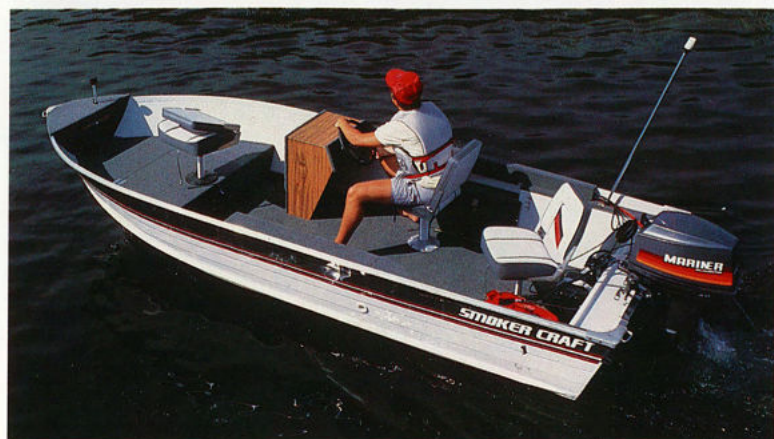
15' Resorter With Console Length: 15'5" Beam: 72" Horsepower: 50 Weight: 540 Capacity: 1000