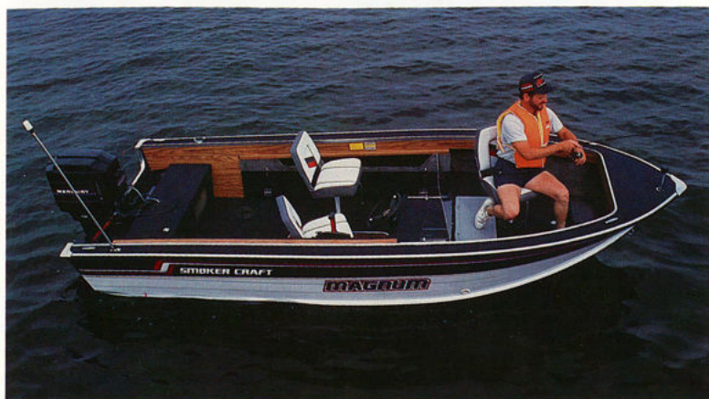
161 Magnum Length: 16'2" Beam: 76" Horsepower: 80 Weight: 700 Capacity: 1400