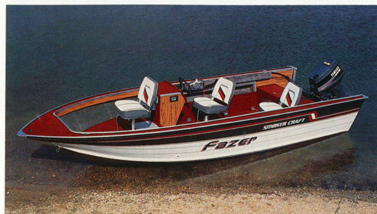
171 Fazer Length: 17'5" Beam: 80½" Horsepower: 115 Weight: 800 Capacity: 1350