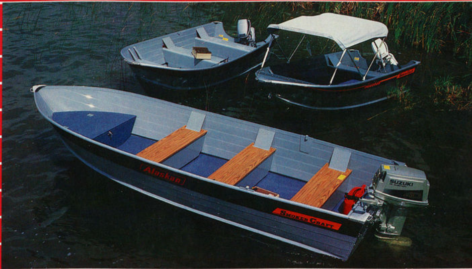
The rugged and reliable Alaskans are popular Smoker-Craft boats. See our specifications chart for more information.