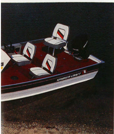
er: 115 Weight: 790 Capacity: 1350