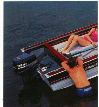
Spirit Fish and Ski Length: 16'2" Beam: 76" Horsepower: